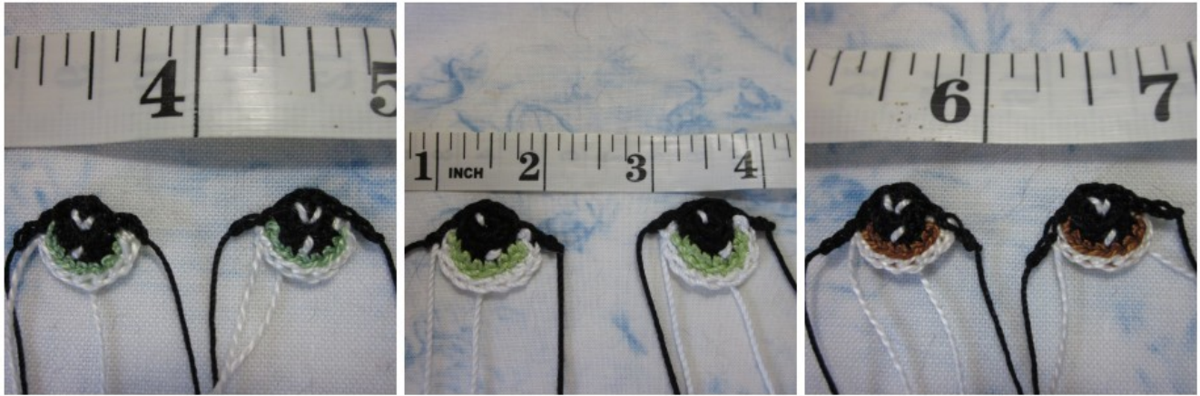
On the left and right, small eyes; in the middle are large eyes