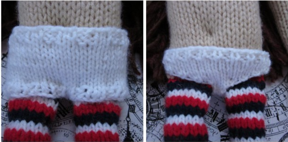
short style on the left, bikini style on the right