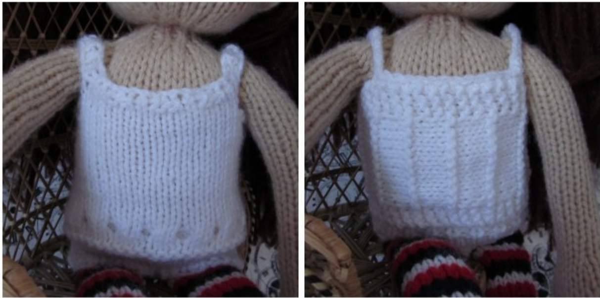
T-shirt style on the left; side-to-side camisole on the right

Tee shirt or camisole 1: worked from the neckline down in one piece